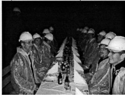
Lunch in the concert hall in the old museum mine