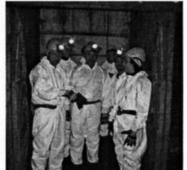
In the elevator going down in the production area in the mine