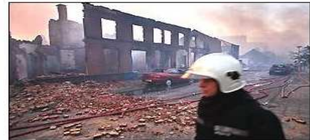
The aftermath of the blaze looked like a bomb site

The operation has now become a grim hunt for bodies among the rubble of the approximately 400 destroyed homes.