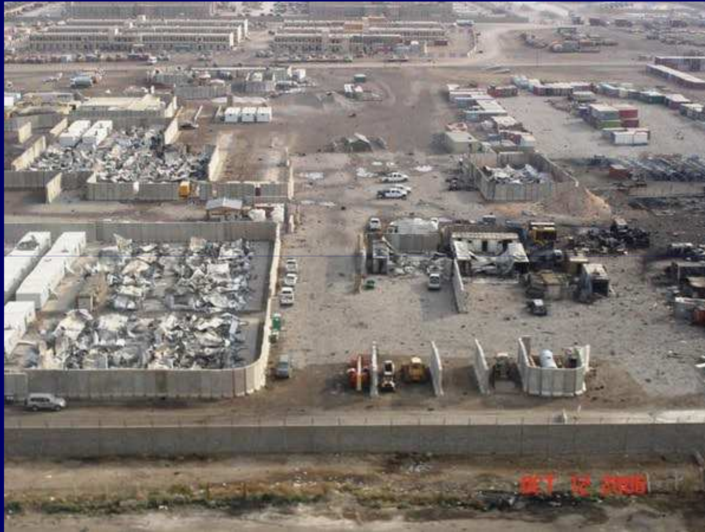
Camp Falcon – Iraq- Oct 2006

Developing skills in the explosives munitions and search sector