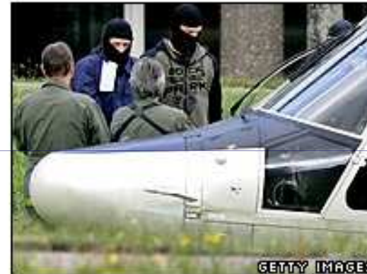
A masked officer leads a terror suspect (in blue) to a helicopter

Defence Minister Franz Josef Jung said the men had posed "an imminent threat".